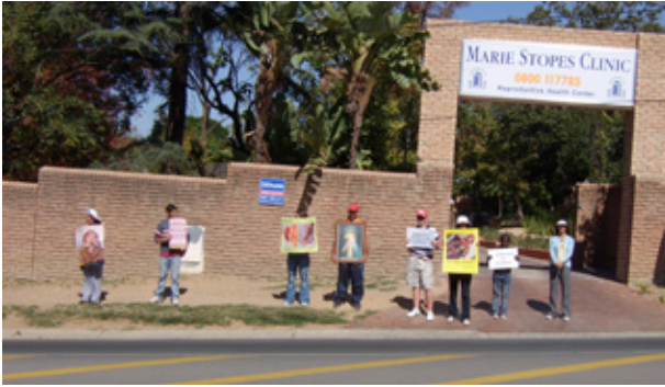
Maronite Pro-lifers pray and protest against abortion.

C HOOSE LIFE - our Maronite Pro-life Motto - is demonstrated every first Saturday of the Month outside the Marie Stopes Clinic, Bryanston, 18 Peter Place, 10 AM when we pray the Rosary and Divine Mercy Chaplet for the intention of ending abortions in South Africa and throughout the world.