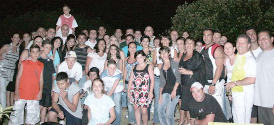
DURBAN'S LEBANESE CELEBRATE NEW YEARS DAY AS ONE, BIG AND HAPPY FAMILY. - 31 DEC